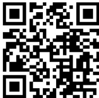
Registration Website QR Code